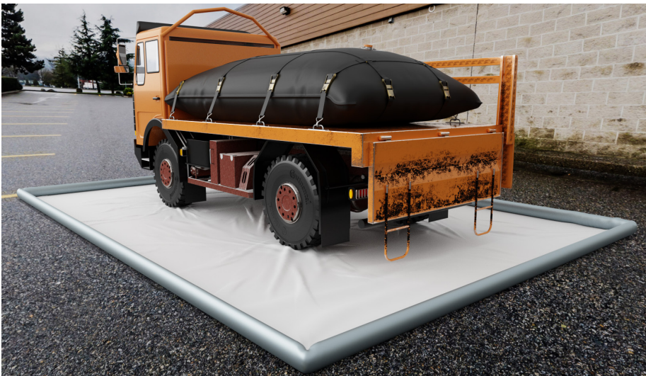
Mobile refueling area and collapsible tank

Storage and transport tanks from FENOTEC ( made in Germany ) are suitable for transporting, collecting and temporarily storing liquids. Special designs can be made for individual applications such as disaster relief, environmental protection or for supplying remote areas.