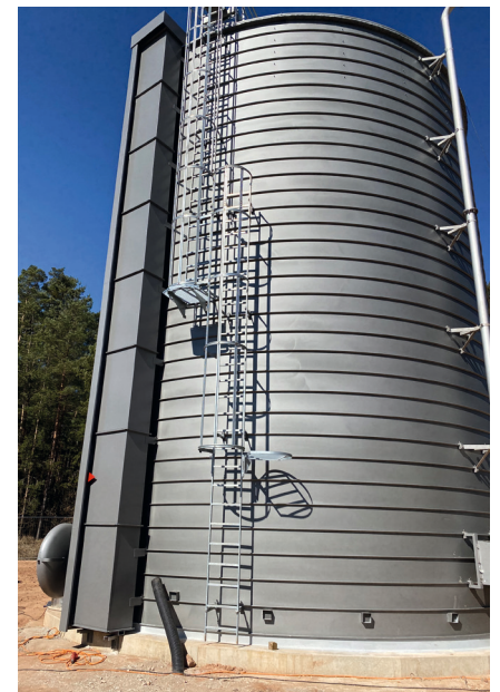
Biogas gas storage in use